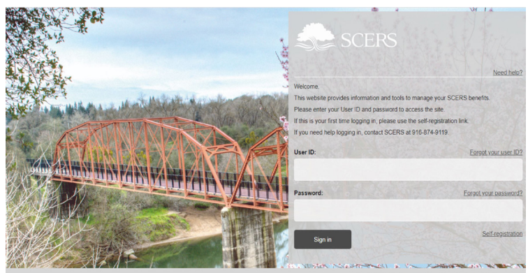
Member Portal in Development