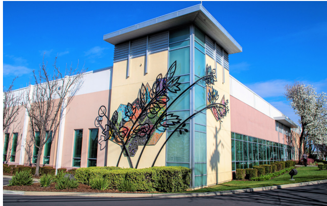
SETA Office, 925 Del Paso Blvd.

The Sacramento Employment Training Agency (SETA) has been a valued employer with SCERS since the agency's formation in 1978, serving our community by connecting people to jobs and business owners to employees through workforce development services. SETA also provides education and nutrition to children through the Head Start program, and assists refugees in achieving economic self-sufficiency.